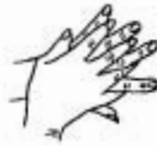
Interlace fingers of right hand over left and vice versa