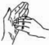
Rotational rubbing, forwards and backwards with clasped fingers of right hand in left palm and vice versa.