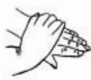
Right palm over left hand and vice versa