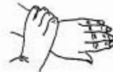
Grasp left wrist with right hand and work cleanser into skin then vice versa.

Rub hands and wrists for 15 seconds, rinse and dry thoroughly.